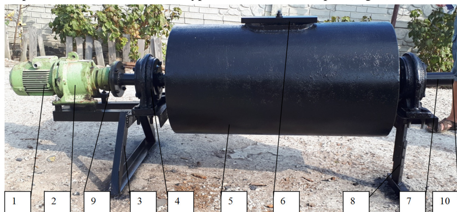
Fig. 1. General view of the pilot plant: 1 – electric motor; 2 – planetary gearbox; 3 – frame; 4 – bearing support; 5 – container; 6 – boot hatch; 7 – axis; 8 – adjustable rack; 9 – connecting muff; 10 – fitting with female thread

For the experimental research, a drum type reactor was developed (Fig. 1).